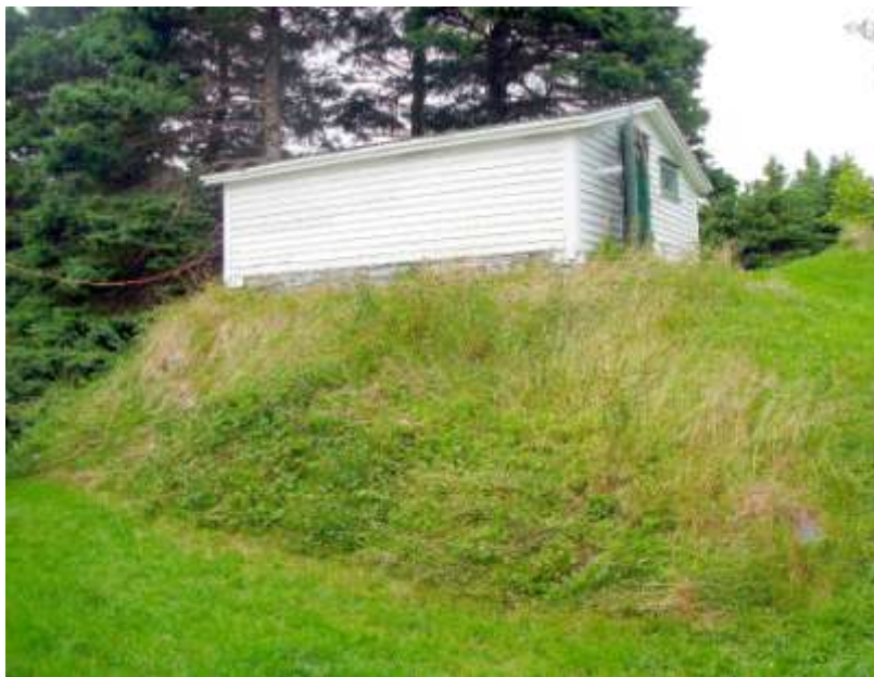
Root Cellar in Colliers

The root cellar deserves our respect and appreciation. It represents a community's ability to grow and store food in the circumstance of a highly seasonal range of temperatures. Potatoes became a crop in Newfoundland at the end of the eighteenth century and have continued to play a major role in our diet. But potatoes spoil if frozen. The root cellar preserved the fall harvest of potatoes safely, without freezing, through the long cold months of winter. The cleverly designed, ubiquitous, root cellar is a heritage structure, an ingenious symbol of survival in the history of our province.