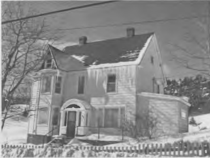
Moseley/Brown (Dockside) House before restoration

The task was a daunting one. The structure was enhanced with new wiring, plumbing and doors, as well as other necessities like insulation, roof work and wooden siding.