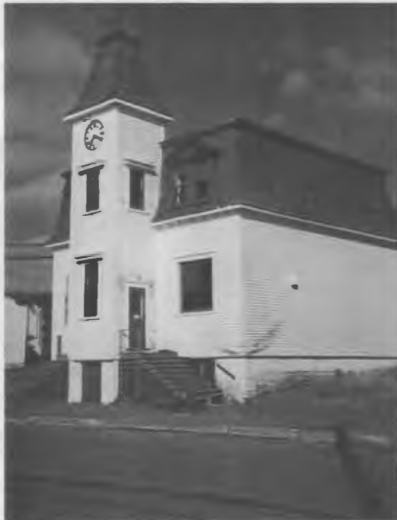
Old Carbonear Post Office in Carbonear before restoration

several years, there was no heating and the electrical needed to be upgraded.