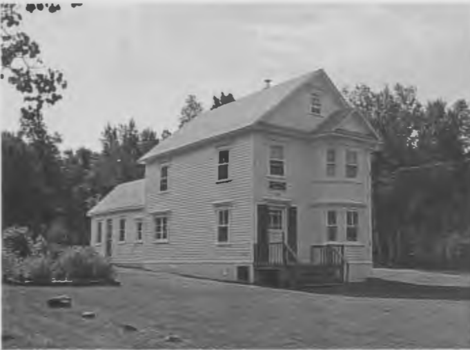
John Hancock House in Portland, Bonavista Bay before restoration

The Hancock House is a two-and-one-half storey house with a pedimented, steeply pitched gable roof, located in Portland, Bonavista Bay. A designated Registered Heritage Structure, this house is both architecturally and historically significant. When the present owners purchased the property in 1985 they were delighted to see that many of the original features of the house were intact.