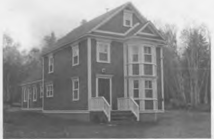
John Hancock House in Portland, Bonavista Bay after restoration