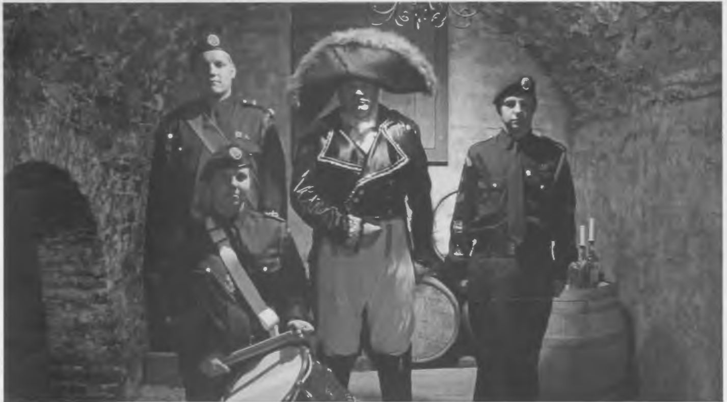
Napoleon Bonaparte with his Honour Guard from the CLB Armory