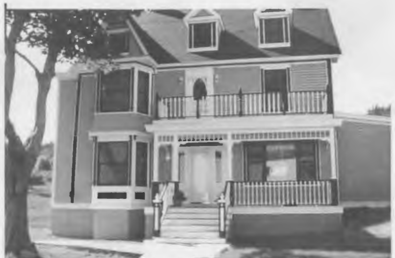
Moseley/Brown (Dockside) House in Burin after restoration