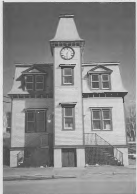
Old Carbonear Post Office in Carbonear after restoration

including restoration of the clock tower and iron cresting. The exterior façade, clad in wooden clapboard, was painted a historic dory buff yellow with green trim; wooden shingles were put on the Mansard roof and all original windows and doors were reused. The interior was in need of major repairs, and all original materials that could be were reused.