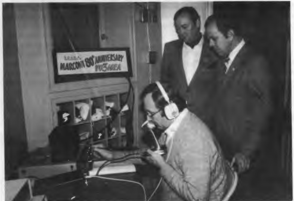
Members of the Society of Newfoundland Radio Amateurs await a signal from Cornwall, England, re-enacting Marconi's feat of December 12, 1901.