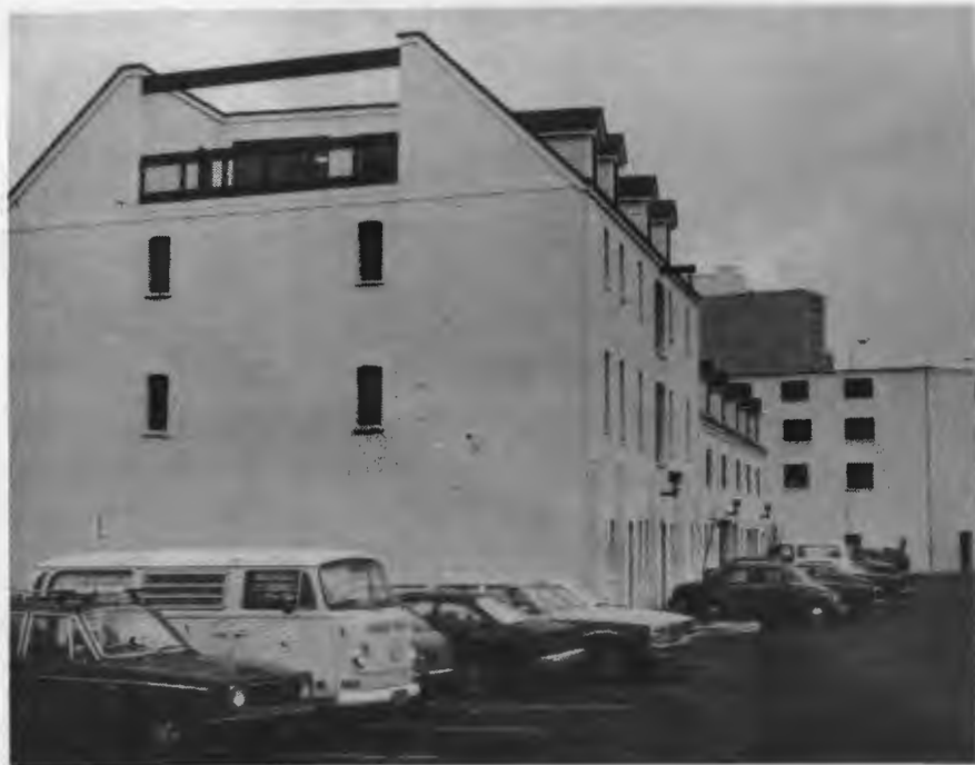
THE MURRAY PREMISES