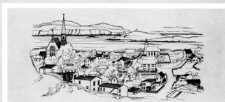
HERITAGE ARCHITECTURE IN NEWFOUNDLAND NEWFOUNDLAND HISTORIC TRUST